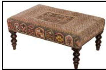
Rugs aren't just for covering the floor. An antique kilim rug, a style originating in Western Asia, found another life as upholstery for a 20th-century bench.

kilims are flat woven, tapestry style, typically from wool. Their designs are usually geometric and often symbolic. Oriental rugs were introduced to western Europe and America by the 18th century.