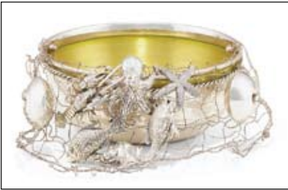
Three-dimensional figures of animals and wildlife are often seen on elaborate silver pieces. This bowl takes a slightly different approach, with figures of sea animals attached to a wire net.

Collectors and makers alike know that there are many ways to decorate silver. It can have an engraved design or monogram. It can be pierced or reticulated with lace-like cutouts. A textured design may be hammered, gadrooned, repousse or made with another technique. Some of the most elaborate and complex decorations on silver are applied; that is, made separately and then attached to the silver piece.